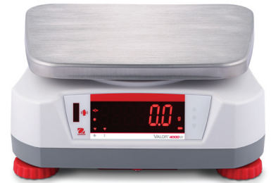
Rear Display with Integrated Touchless Sensor