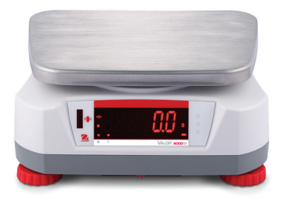
Rear Display with Integrated Touchless Sensor