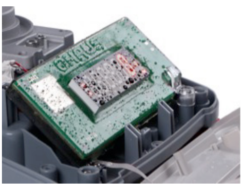
Inside PCBA Silicon Glue Sealing

The flow-thru, water-resistant design allows for safe weighing of liquid components and can be used in harsh or damp environments. Valor 2000's IPX8 full waterproof construction and silicon glue sealing design to its PCBA make it durable in extreme environments and eliminates the risk of water damage. Additionally, cleaning your scale has never been safer and easier, further ensuring the cleanliness of your workstation.