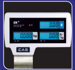
Pole Display Option